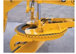
1339 mm gear driven circle with “A” frame allows 360° blade rotation