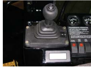
Full power shift transmission with torque converter