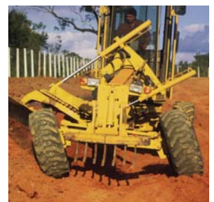
90° Bank slope saddle